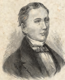
Isaac Pitman, 1900

The Shorthand Writer becomes NSRA's official publication, and the annual National Speed Contest is established. The first contest marks the beginning of one of two great eras of championship steno writing. Pitman and Gregg pen writers dominate the first era.