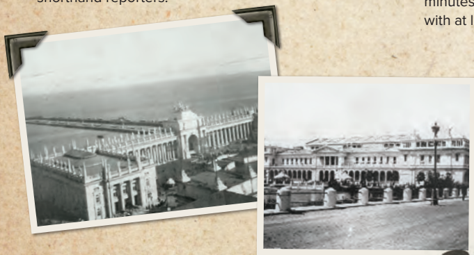
Pictured: Music Hall and Peristyle (left) and Women's Building at site of the World's Congress of Stenographers